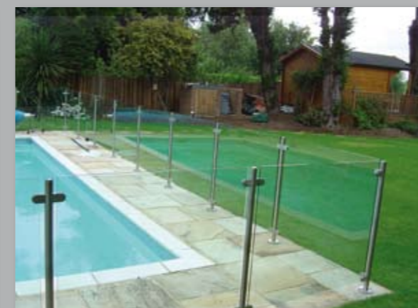
Swimming Pool Surrounds