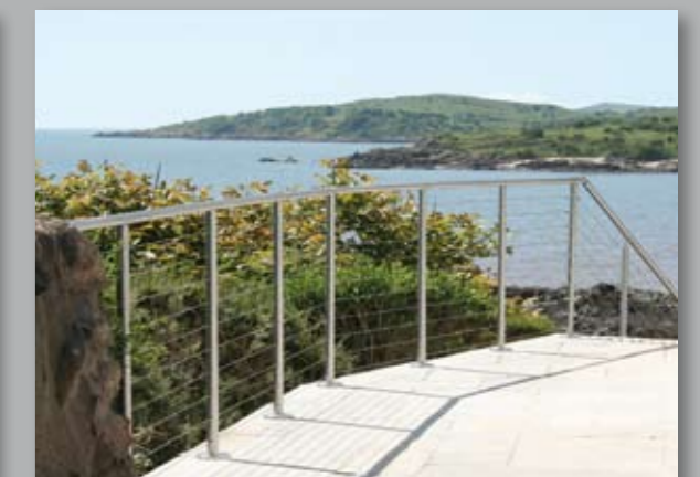
Also Available... Wire Rope Balustrade