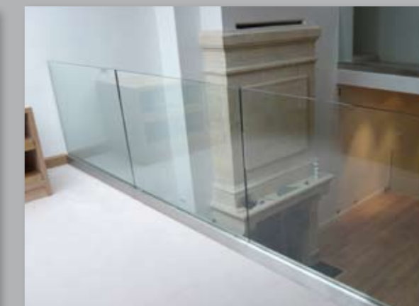
Glass Channel System - Internal